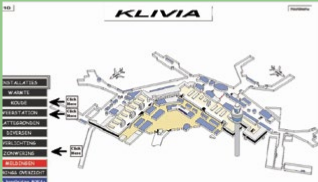
Main Menu Screen at Schiphol Airport

“The Alias functionality within the product saved us a lot of time in building displays. This enabled us to reuse the same display for another floor.”