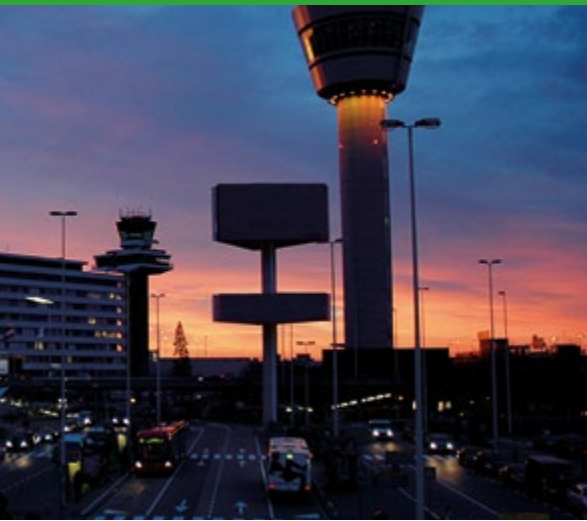
Approaching the Tower Amsterdam Airport Schiphol