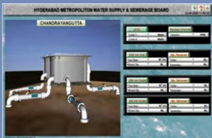
Overview of the Chandrayangutta Tank