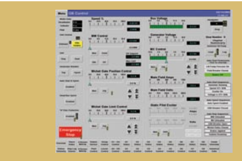
Hemi Controls Control Screen