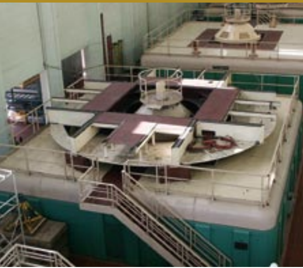
Power generation facilities in Ontario, Canada