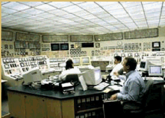
Plant Control Room at AmerenUE Callaway Facility