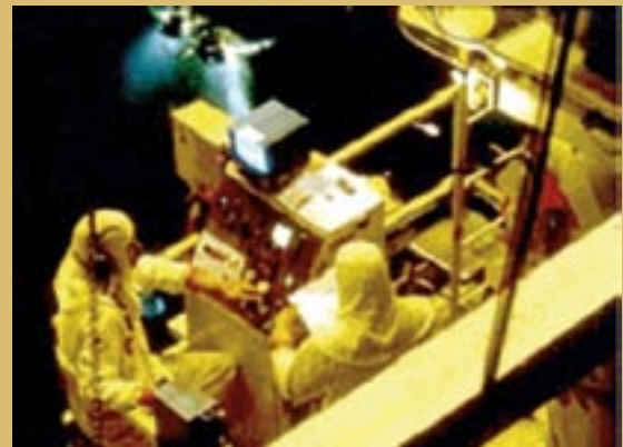
Operators at Refueling Machine Controls