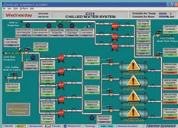
A Thermo Systems Water Chiller Screen

Thermo Systems applications include validated pharmaceutical HVAC systems.