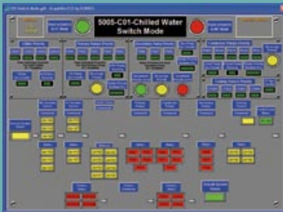
Switch Control Screen

software tools on the market, Thermo Systems selected ICONICS' GENESIS32. This OPC-based software provides a non-proprietary, graphical front-end solution with unparalleled integration and a proven guaranteed migration path. ICONICS' GENESIS32 has met and exceeded all of Thermo Systems' graphical software requirements.