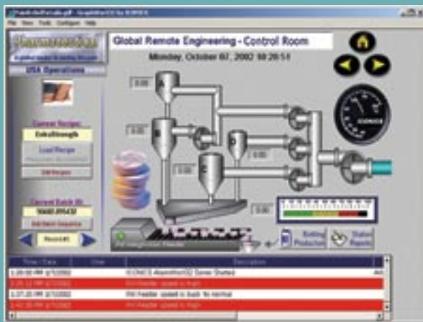
Another GENESIS32 Example for the Pharmaceutical Industry.

After a successful first implementation, this customer is now considering ICONICS' Alarm Analytics™ component as well as additional solutions for facility performance analysis, new KPIs and electronic batch records.