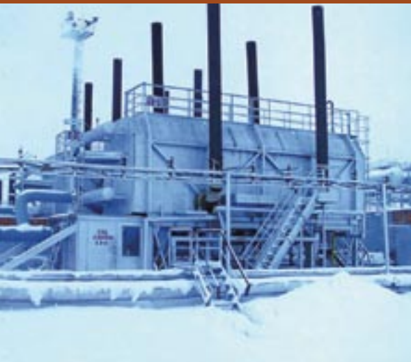
A Russian Oil Processing Plant Client of SC «ATS»