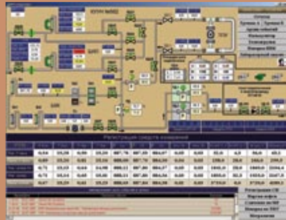
Example of GENESIS32 Control Screen for Russian Oil/Gas Customers

ICONICS GENESIS32 was selected to replace a proprietary, in-house visualization system and was implemented quickly, compared to the previous solution. SC «ATS» knew immediately they had made the right choice in that system response to events now occurs in less than a second. Objects are easily visualized in a user-friendly Web interface and the installed system has been deemed easy to expand. In addition, the company has realized improvements in overall system-level security and in the oil and gas processes themselves.