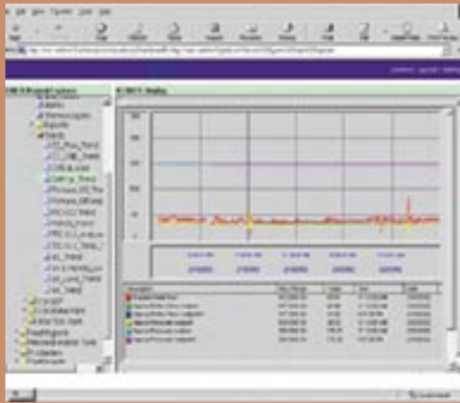
Steam Production Trend

ning on Windows 2000 and Internet Information Server from Microsoft, provides real-time OPC data for the view-only screens. Benefits of the system include faster responses to equipment shutdowns through a more automated notification process with AlarmWorX Multimedia. Another benefit is increased generator energy efficiency through trend analysis and remote monitoring.