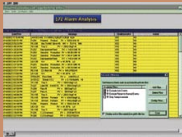
Alarm Summary Display

weekly, and longer trends, as needed, to manage the flow of oil through the plants and into the distribution and storage network.