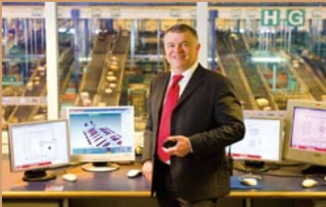
The control room in a Dematic warehouse

"...They really understand what we do and what we need; when I make a support call it does not matter to who I speak as they all know who we are, what we do and at what level to address our request. We never need to escalate a support request - we leave ICONICS to do that."