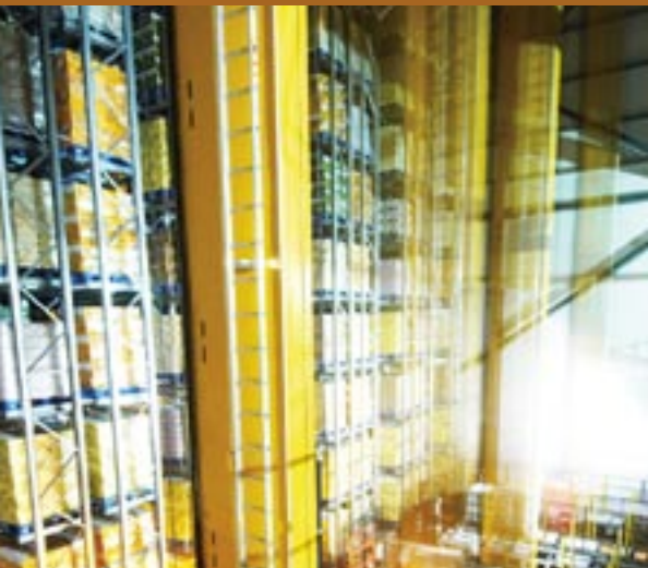
A Dematic warehouse