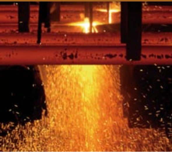
Sparks fly during steel production at AFV Beltrame S.p.A.